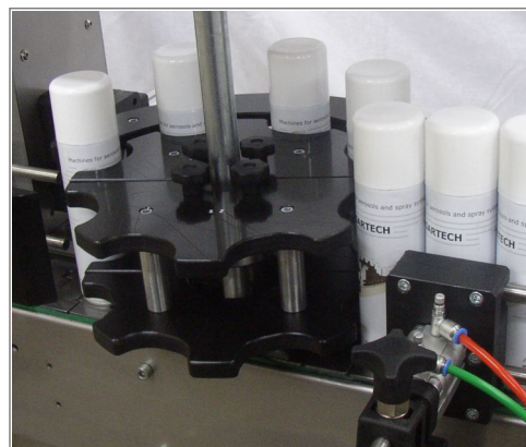
Rotational mechanism is a checkweigher DWR/H series

*- Profibus module available on client's request (option)