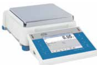
PS 6100.3Y - PS 10100.3Y