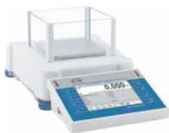
PS 200/2000.3Y - PS 1000.3Y