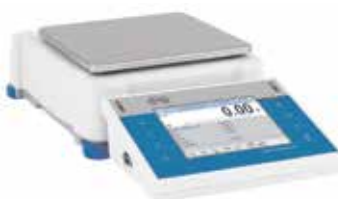
PS 1500.3Y - PS 6000.3Y