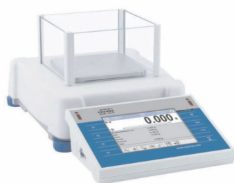
PS 200/2000.3Y - PS 1000.3Y