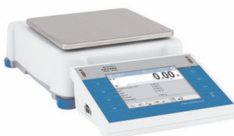
PS 1500.3Y - PS 6000.3Y