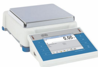
PS 6100.3Y - PS 10100.3Y