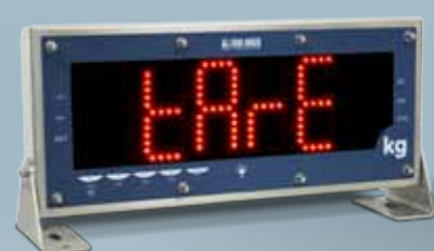
DGT 100 INSTALLATION ON THE TABLE WITH ADJUSTABLE BRACKETS