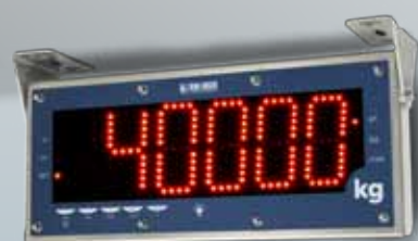
DGT 100 WALL MOUNTING WITH ADJUSTABLE BRACKETS