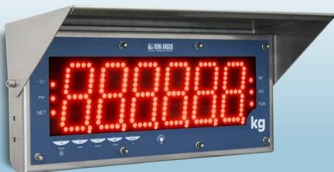
DGT 100 INSTALLATION WITH VISOR